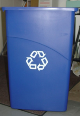
Plastic recycling bins available at Tribal building

“Currently we are working on informational handbooks for the Port Lions School to study for our upcoming Earth Day poster contest.”