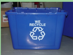
Paper recycling bins available at Tribal building

“Currently we are working on informational handbooks for the Port Lions School to study for our upcoming Earth Day poster contest.”